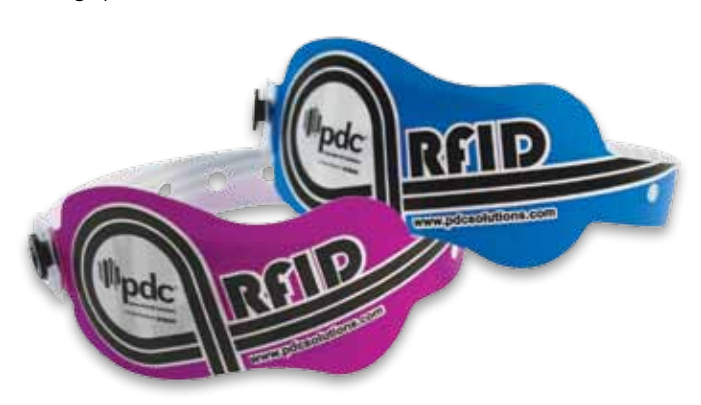
See RFID Tag specifications on back cover